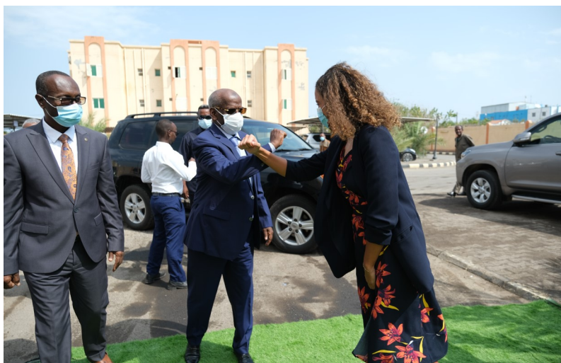
The Prime Minister welcomed by IOM Djibouti Chief of Mission at the inauguration ceremony of the national coordination mechanism for migration.

Inauguration of the National Coordination Mechanism for Migration.