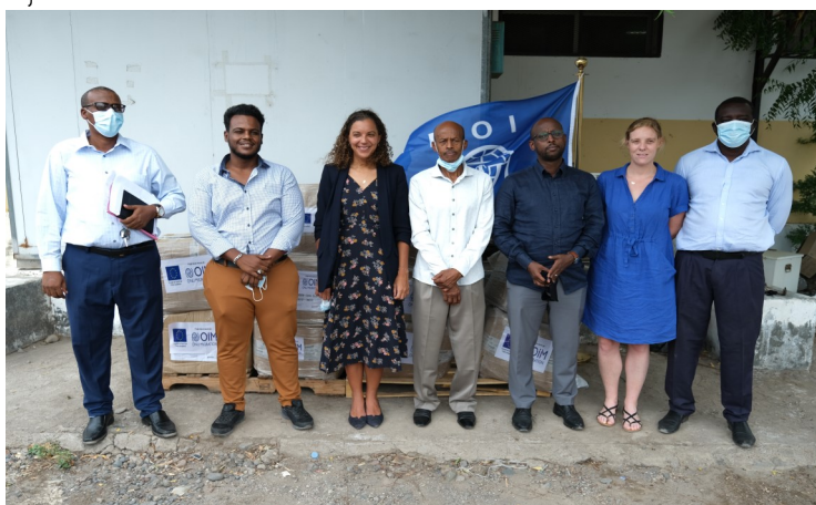
Delivery of equipment to the Ministry of Health

On Wednesday 28 July 2021, IOM donated 500 body bags to the Ministry of Health, thanks to the financial support of the European Union within the framework of the project "Durable solutions for the most vulnerable host populations, refugees and migrants in Djibouti".