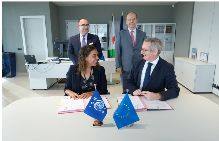
IOM/EU funding agreement signing ceremony

of 3.5 million euros. This project aims to support the Government of Djibouti in managing migration issues and to better assist migrants, refugees and vulnerable populations in need.