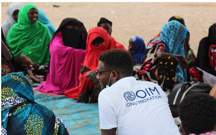
Discussion group between migrants and host communities

On Monday, July 5, 2021, IOM conducted a discussion between a group of migrants and members of the community of Fanteherou on social cohesion. In total, 38 members of the community and 5 migrants housed at the Migration Response Center (MRC) in Obock, took part in this discussion whose main goal was to better understand the dynamics within the community and improve cohabitation in this neighborhood where migrants who decide to leave for the Gulf countries transit.