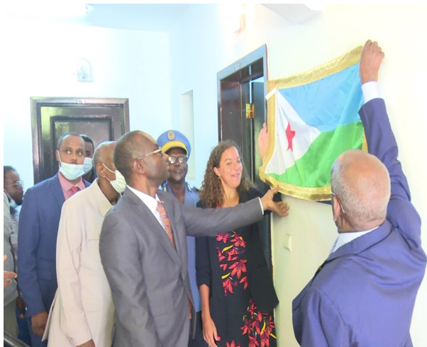
Inauguration ceremony of the National Migration Coordination Office

Thanks to the funding from the U.S. Department of State's Bureau of Population, Refugees and Migration (PRM), the Ministry of the Interior established the office of the National Coordination Mechanism for Migration with the support from IOM. On July 29, 2021, the Prime Minister H.E. Abdoukadir Kamil Mohamed inaugurated this office in the presence of the Minister of Interior, the Minister of Defense, the Minister of Women and Family, the Minister of Trade, the Minister of Environment and the Ambassadors of the European Union, the United States and Ethiopia, the chargé d'affaire of the Embassy of Japan and the IOM Chief of Mission. This office, placed under the Ministry of the Interior, will coordinate all migration issues in the country and will be the main interlocutor of partners working on migration at the national, regional and global levels. It will enable the Djibouti government to meet the challenges facing the country in terms of migration, but also to seize the opportunities linked to the migration phenomenon.