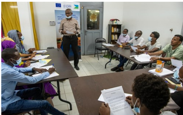
Writing workshops on migration at the « Maison des contes et des écrivains »