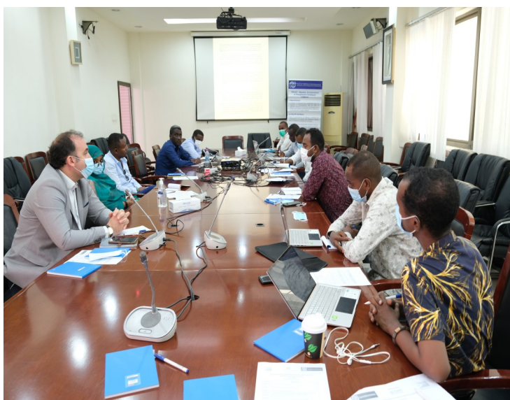
Launch of the validation meeting of the MECC project studies at the palais du People

As part of the follow-up of the implementation of the project on migration, environment and climate change, a validation meeting of the studies on potential livelihoods for environmental migrants and host communities was held at the palais du People on June 1, 2021. The conclusions of these studies were also shared with the relevant communities in Obock during consultation meetings that were organized on June 6 and 7, 2021.