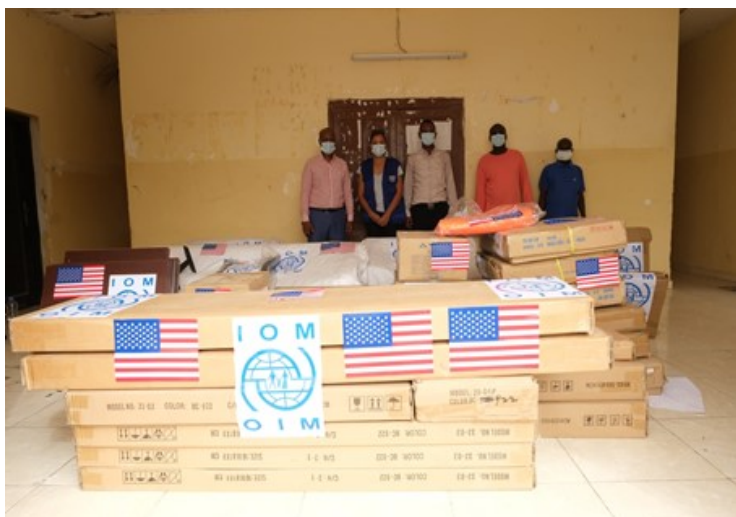
Materials donation ceremony at the Prefecture of Obock

During the month of June, as part of the Regional Migration Response Plan (MRP) and with the funding from the U.S. Office of Population, Refugees and Migration (PRM), IOM donated computer equipment and office furniture to the prefecture of Obock. The prefecture continues to be a key partner in migration management.