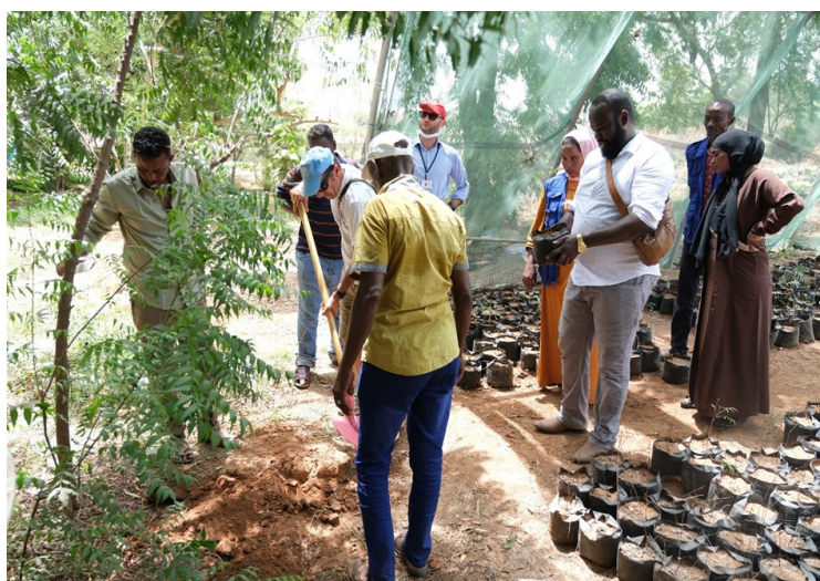
MRC staff members in training with FAO experts on tree planting and maintenance

A training on the techniques of planting and maintenance of different types of trees for the benefit of 6 staff members of the MRC was held on June 22, 2021, with the assistance of the Directorate of Agriculture and Forestry (DAF) of the Ministry of Agriculture, Water, Fisheries, Livestock and Fisheries Resources and the United Nations Food and Agriculture Organization (FAO).