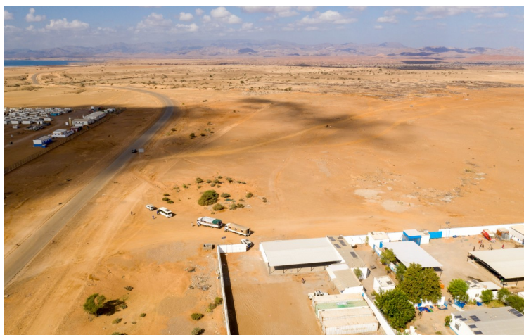
Aerial view of IOM's MRC in Obock.

IOM continues to provide emergency assistance to respond to the continued arrival of vulnerable migrants in Obock from Yemen. During the month of June, the mobile unit provided 687 vulnerable migrants (602 men and 36 women), including 49 children, with water, food, and medical assistance. 389 vulnerable migrants hosted at the Migration Response Centre (MRC) in Obock received food, water, non-food items (NFI), and medical and psychosocial support. Thanks to the European Union funding, IOM continues to assist migrants staying at the MRC, and those in transit to Ethiopia.