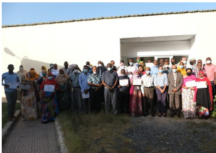
Group photo of the closing ceremony of the emergency health training

41 health professionals working in Djibouti and in the regions were trained on the preparedness and response to the health emergency during 6 months.