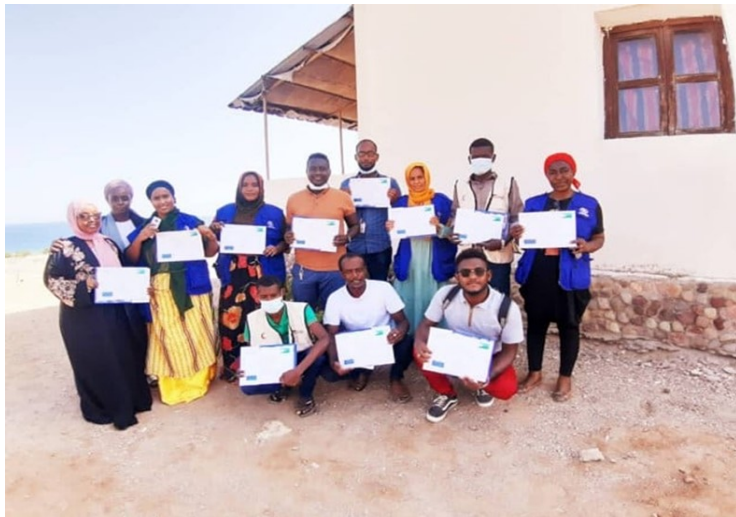
Protection training for IOM staff and partners in Obock

Thanks to the funding of the European Union, within the framework of the same project, from May 30 to June 2, IOM has conducted a training on protection for 15 persons among which agents of the Djibouti Red Crescent and IOM staff in Obock. This training, animated by the protection officer, allowed the participants to reinforce their knowledge in terms of protection, identification of victims of trafficking and child protection.