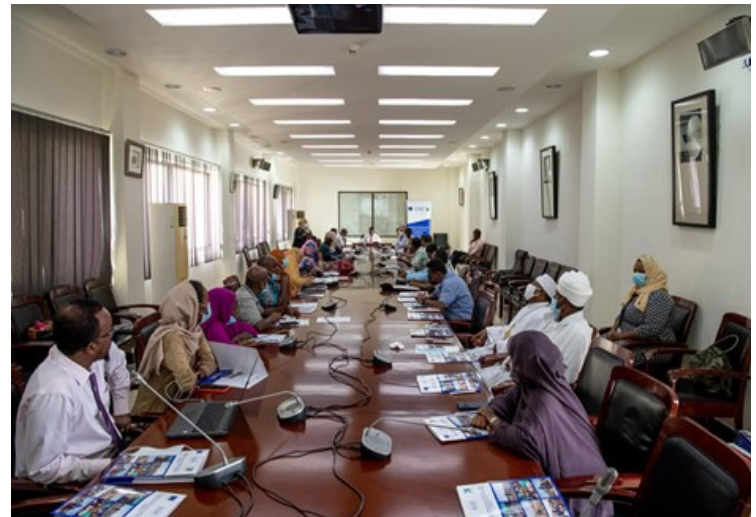
The working groups on the NRM at the palais du Peuple

From 15 to 16 June 2021, IOM organized a workshop on the national referral mechanism for vulnerable migrants in Djibouti at the Palais du Peuple. Various round tables on child protection, food and material assistance, medical and psychosocial assistance, reproductive health and gender-based violence punctuated the two-day workshop. The document, which will be produced with contributions from government representatives, civil society, and UN agencies, will include a mapping of actors who can provide assistance to vulnerable migrants. This document should enable a quicker and more efficient response to the needs of migrants.