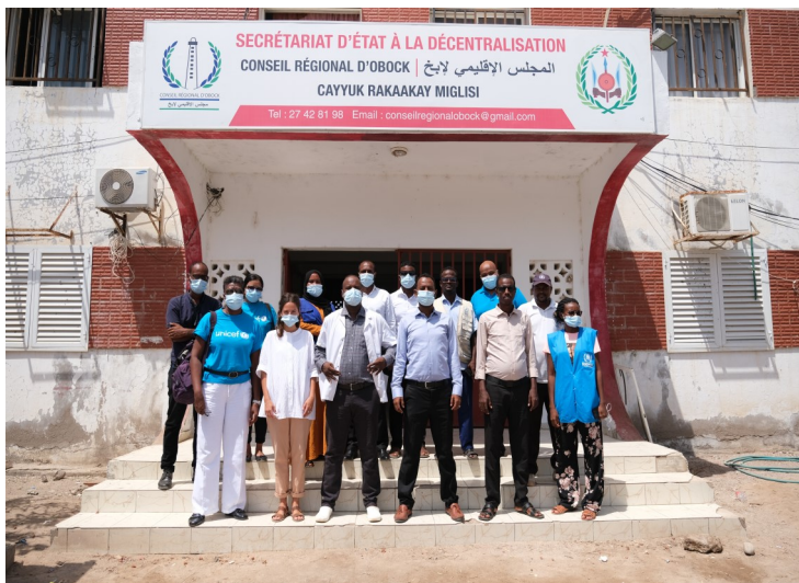
Group photo of the participants to the consultation workshop on the protection of migrants at the Regional Council of Obock

This consultation provided an opportunity to reflect on the collaboration among relevant stakeholders, create synergies among partners, document lessons learned, and develop recommendations for the final year of implementation of the joint initiative.