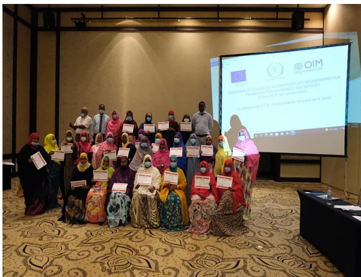
Photo of the presentation of certificates to the midwives who participated in the training

This consultation provided an opportunity to reflect on the collaboration among relevant stakeholders, create synergies among partners, document lessons learned, and develop recommendations for the final year of implementation of the joint initiative.