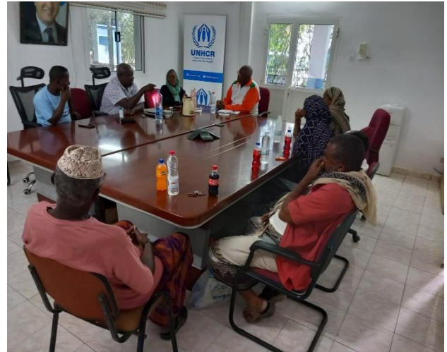
UNHCR Representative held a meeting with refugee leaders.

About 85% of people in forced displacement in Djibouti live in refugee settlements and 15% are urban refugees living in Djibouti city. Over 2,150 are in vulnerable situations including serious medical conditions, people living with disability, unaccompanied children, and other people at risk with specific protection needs.